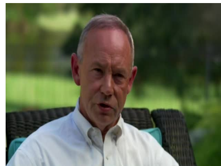
This profession is one of the greatest experiences that a lawyer can have