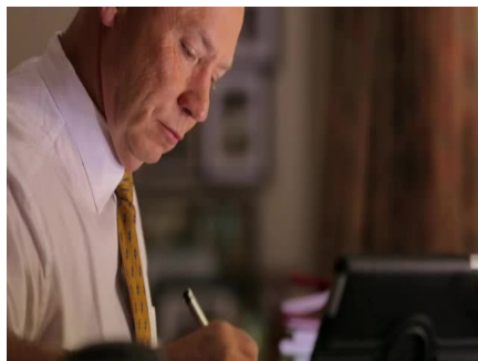
Duke extensive civil and criminal law resume elected him to district court judge, and today he's a respect jurist on our court of appeal