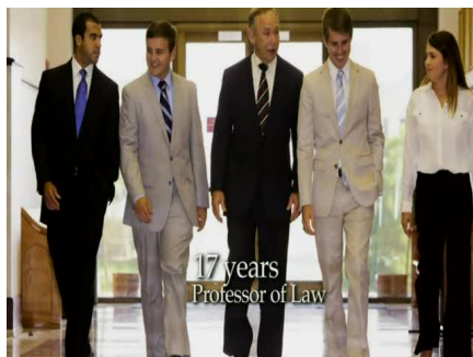
Eighteen years of judicial experience, seventeen years as professor at law, two law degrees