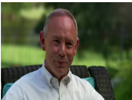
I have the educational background, the legal experience, the judicial experience, coupled with the knowledge of people