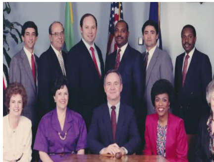
majorities ever for re-election when I ran for a second term on the Baker City Council