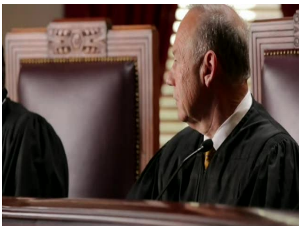
He stared down criminals as a no nonsense prosecutor