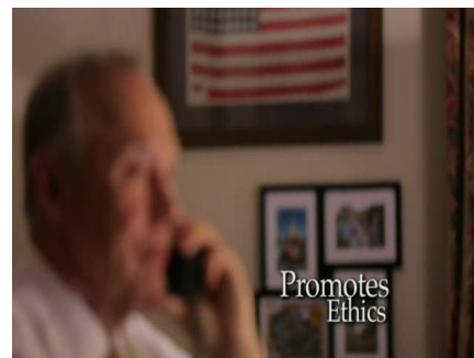
The only judge selected by his peers to promote ethics