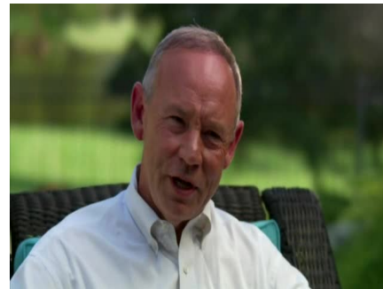
I've helped people in so many problem situations that I understand what they're going through