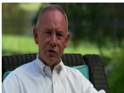
I'm here because I want to help people and make sure justice is done