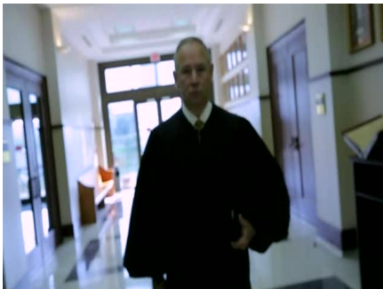
I was elected, and then I was elected by one of the highest