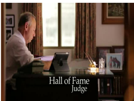
The only judge in the race named to Louisiana's Justice Hall of Fame