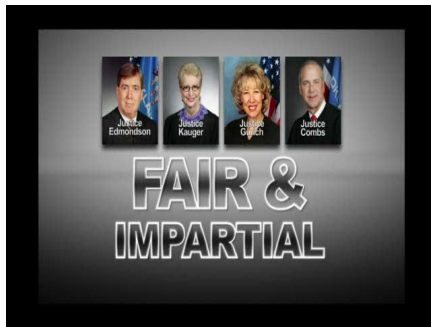
Fair and impartial justices, decisions guided by the law and the Constitution