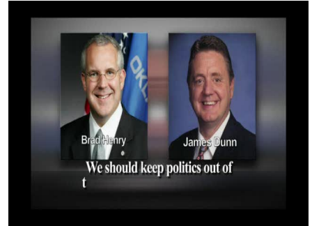
They don't always agree, but they agree on this: We should keep politics out of the Oklahoma Supreme Court