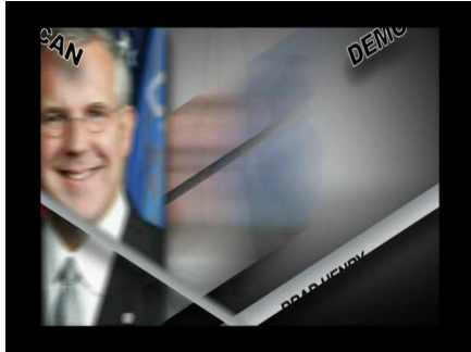
Brad Henry, a Democratic Governor

Brand: Yes For Fair & Impartial Judges - Political Organization (B329.1) Parent: PARENT UNKNOWN Aired: 11/1/2012 8:24:02 PM Creative Id: 11719283