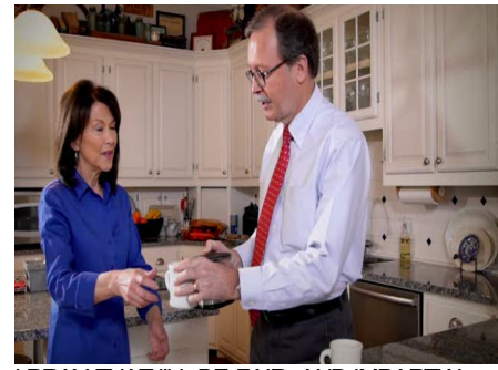
I PRAY THAT I'LL BE FAIR, AND IMPARTIAL,