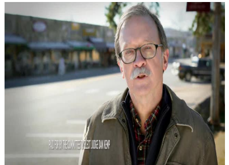
AND UPHOLD THE CONSTITUTION.