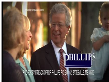
Don't let special interests buy our court