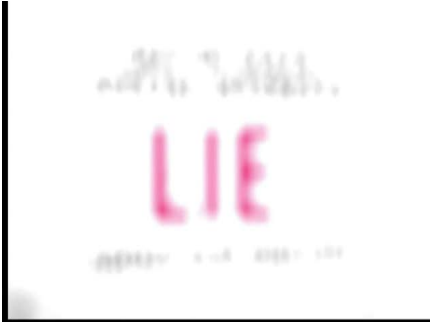
Out of state special interests are lying about Flip Phillips

Brand: Pol-Supreme Court - (B333) Parent: POLITICAL ADV Aired: 10/26/2012 10:12:48 PM Creative Id: 11702121