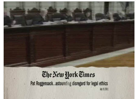
letting special interests donate to justices