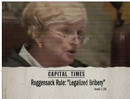
She even risked the integrity of the court creating the Roggensack rule