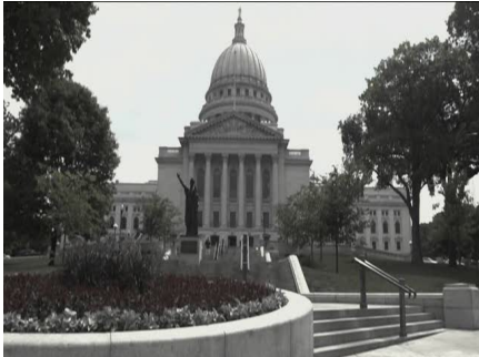
What's happened in Wisconsin over the last few years

Brand: Pol-Supreme Court - (B333) Parent: POLITICAL ADV Aired: 3/20/2013 9:28:06 AM Creative Id: 12244771