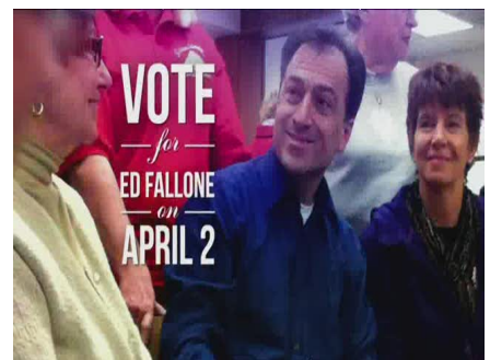
and stand up for the working families of Wisconsin