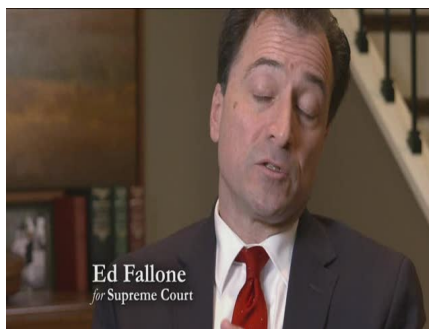
people want to see a justice who has the courage to follow the law