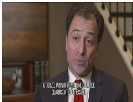
[PFB] That's the kind of justice I'll be