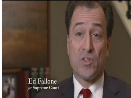
Is we've seen our state supreme court really descend into disfunction