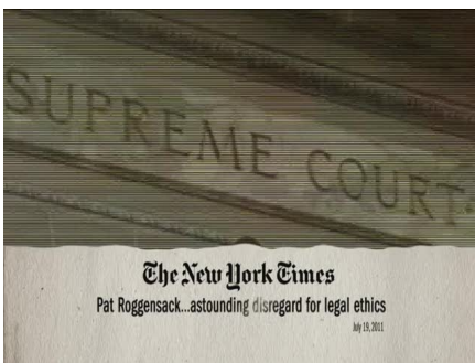
when they have cases in front of the court