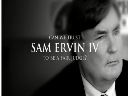
Can we trust Sam Ervin the fourth to be a fair judge?

Brand: Pol-Supreme Court - (B333) Parent: POLITICAL ADV Aired: 11/2/2012 8:58:17 AM Creative Id: 11727392