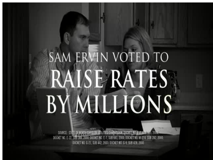
There, Ervin voted to raise our rates by millions