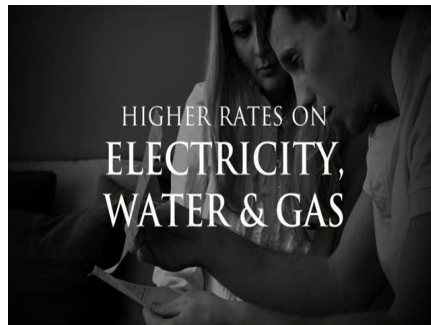
higher rates on electricity, water, and gas